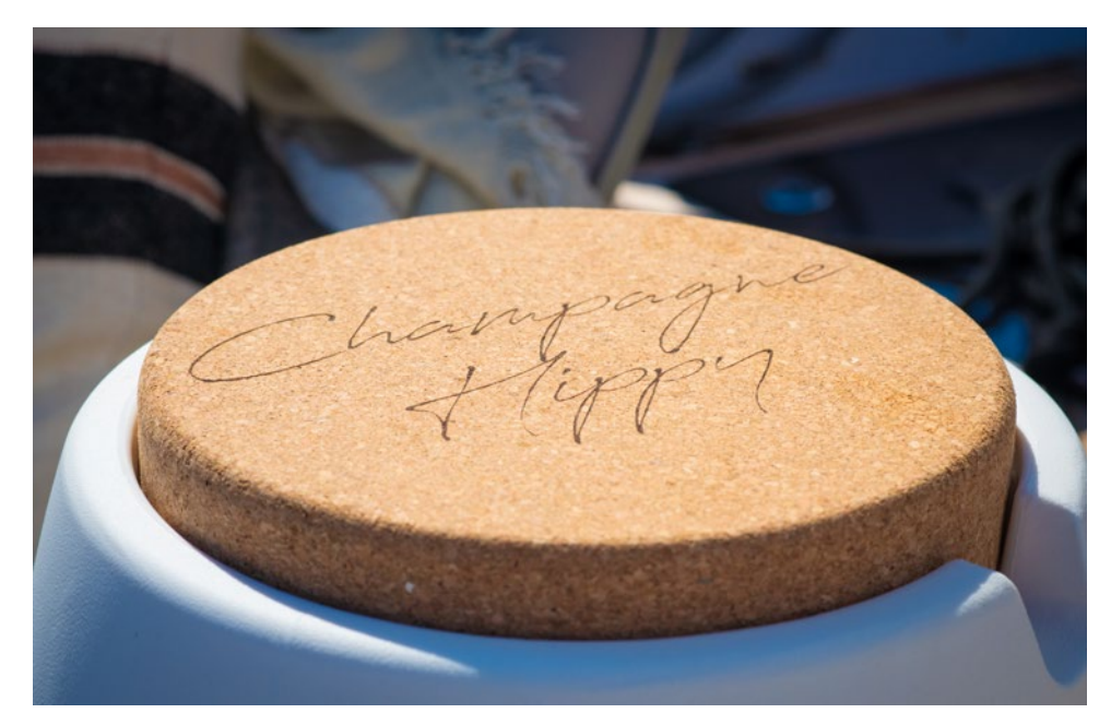
Oyster 825 CHAMPAGNE HIPPY