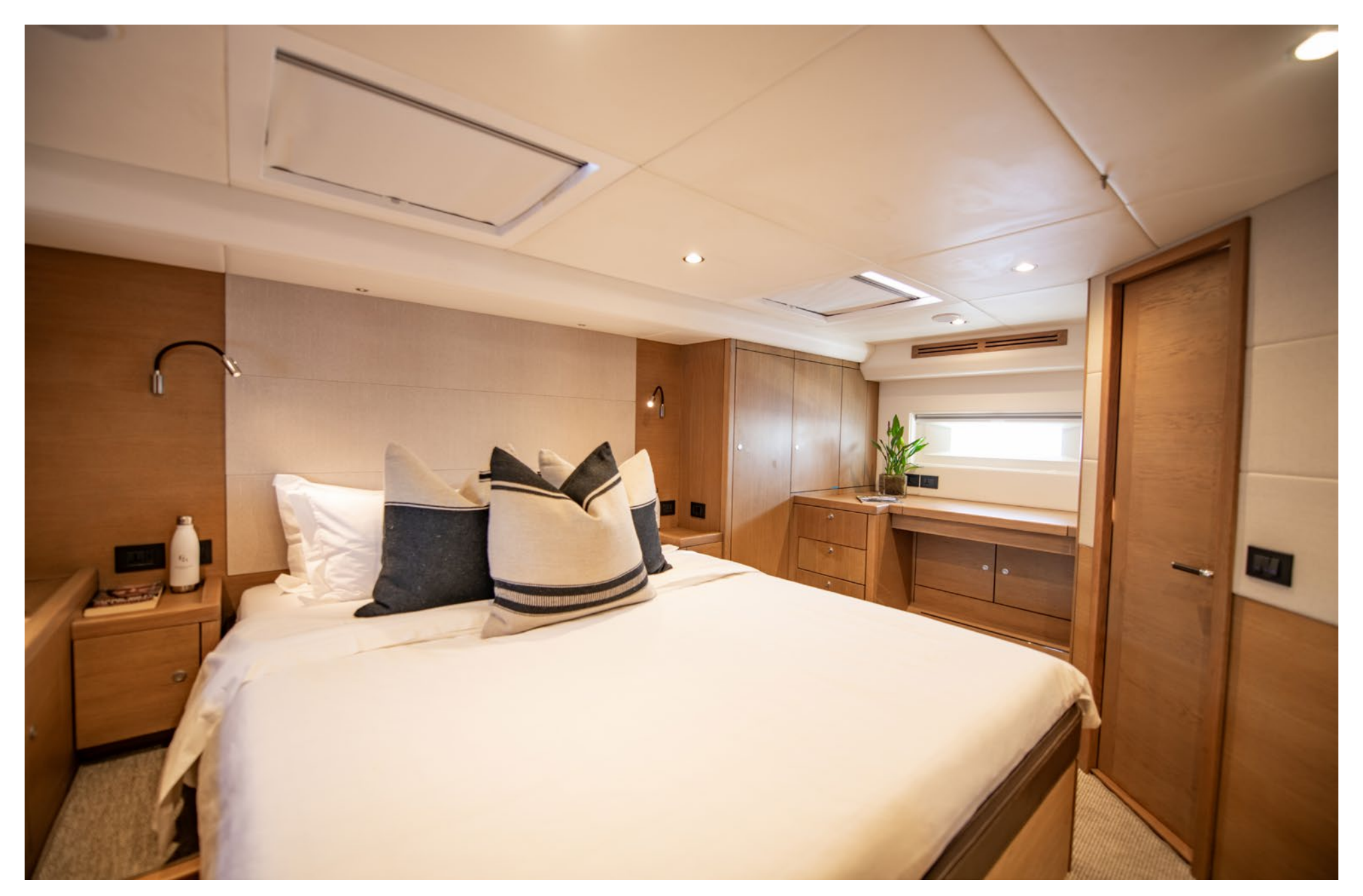
Oyster 825 CHAMPAGNE HIPPY