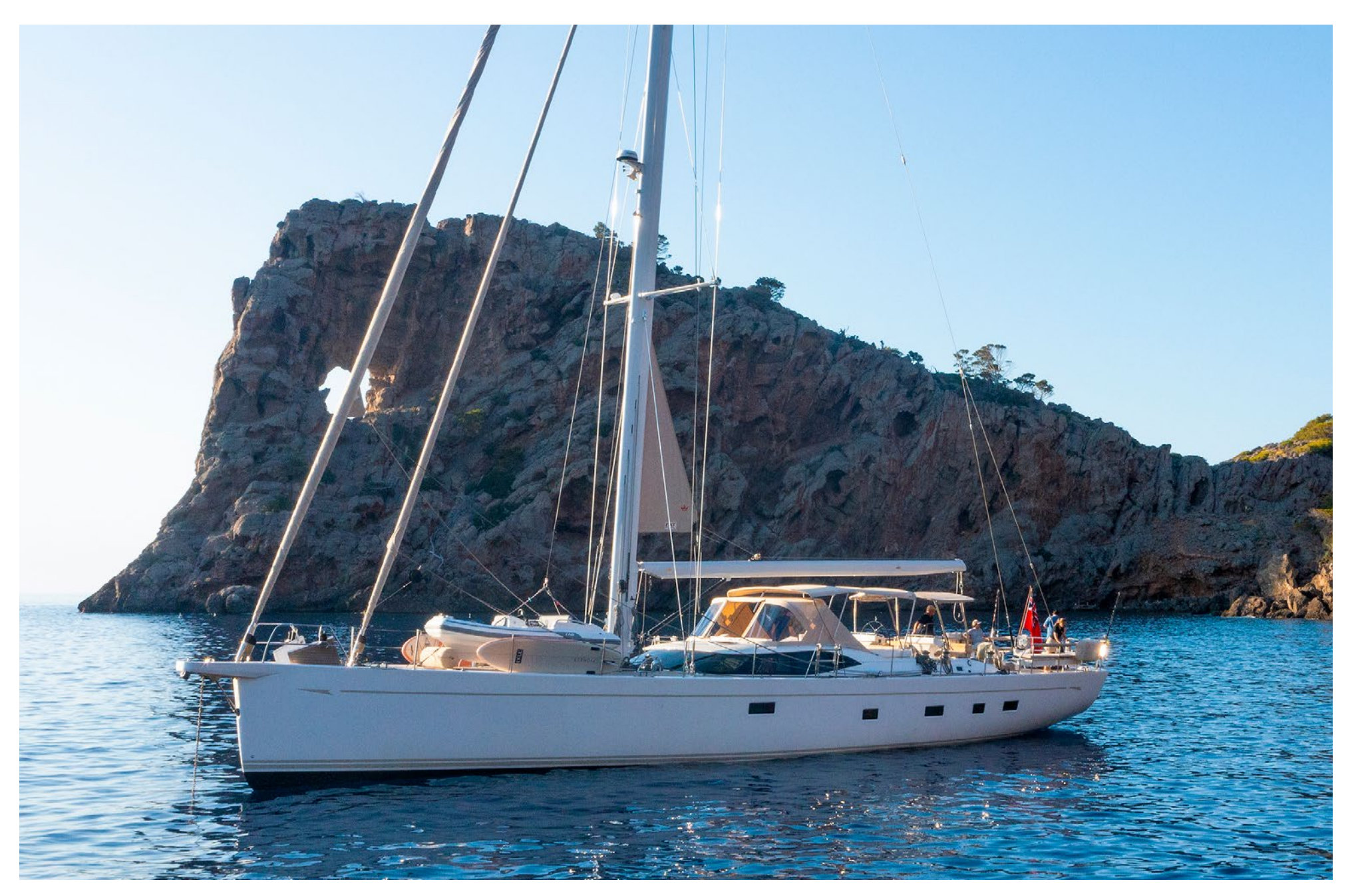
Oyster 825 CHAMPAGNE HIPPY