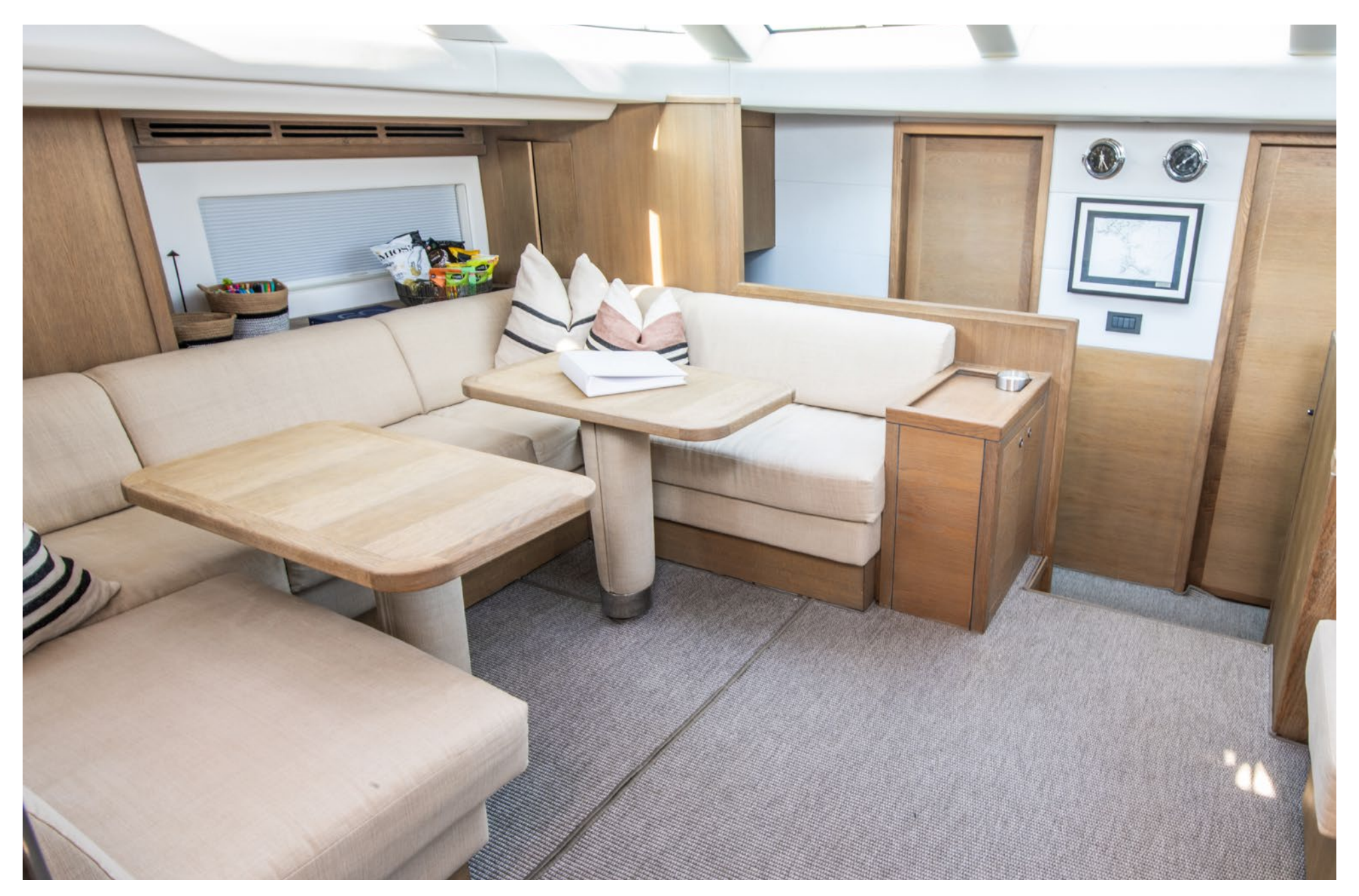
Oyster 825 CHAMPAGNE HIPPY