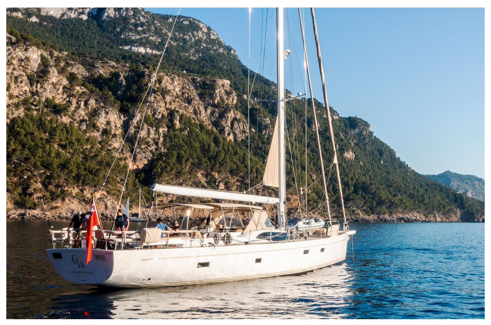
Oyster 825 CHAMPAGNE HIPPY