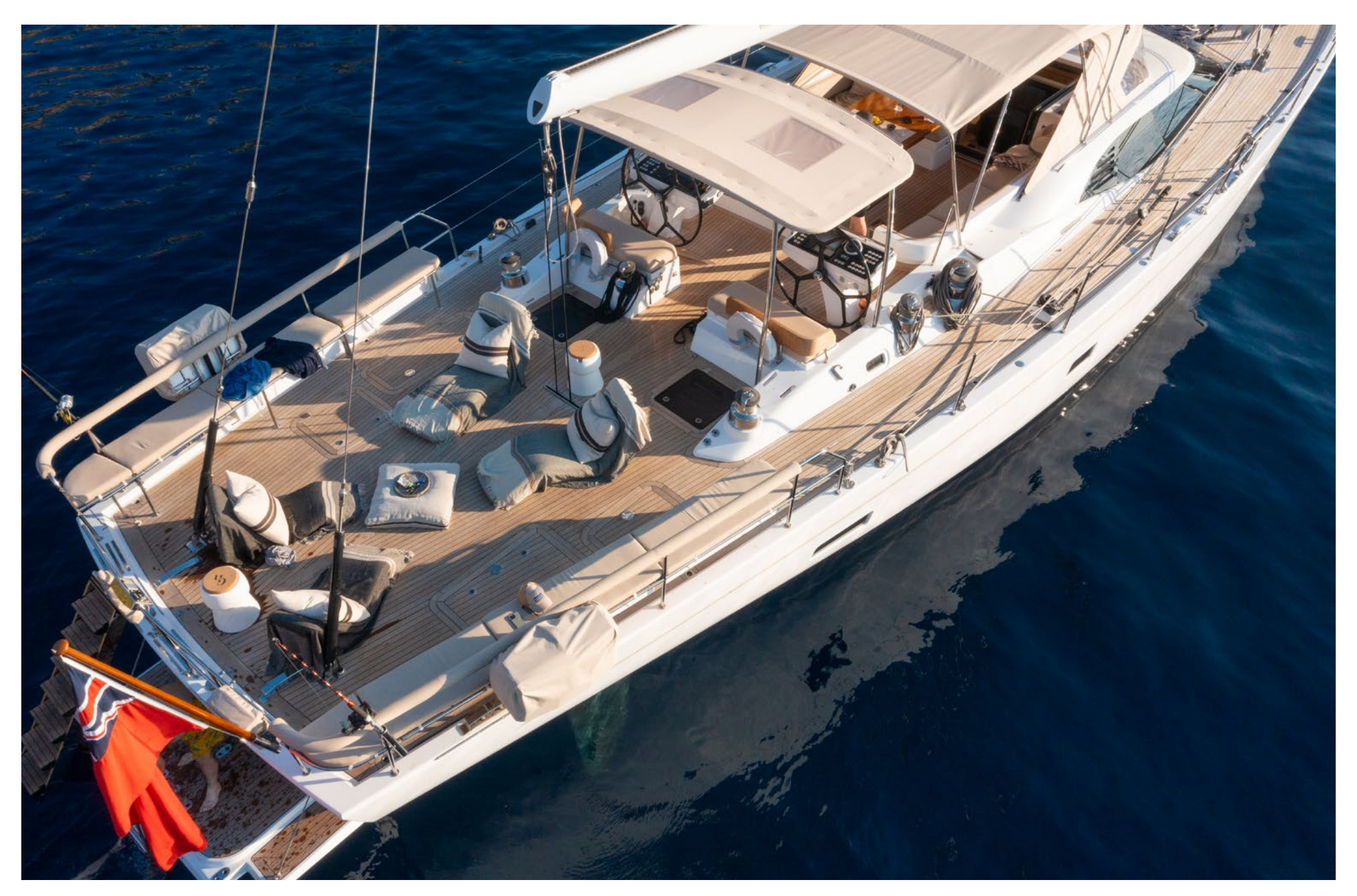
Oyster 825 CHAMPAGNE HIPPY