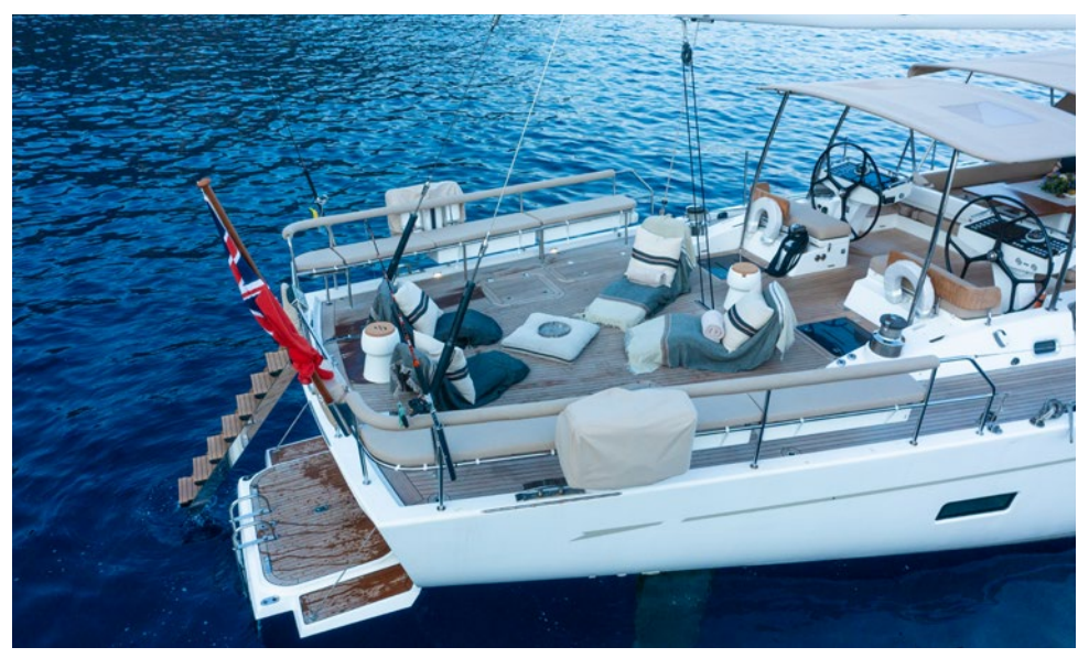
Oyster 825 CHAMPAGNE HIPPY