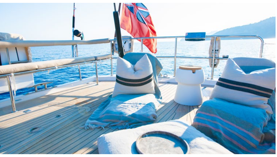
Oyster 825 CHAMPAGNE HIPPY