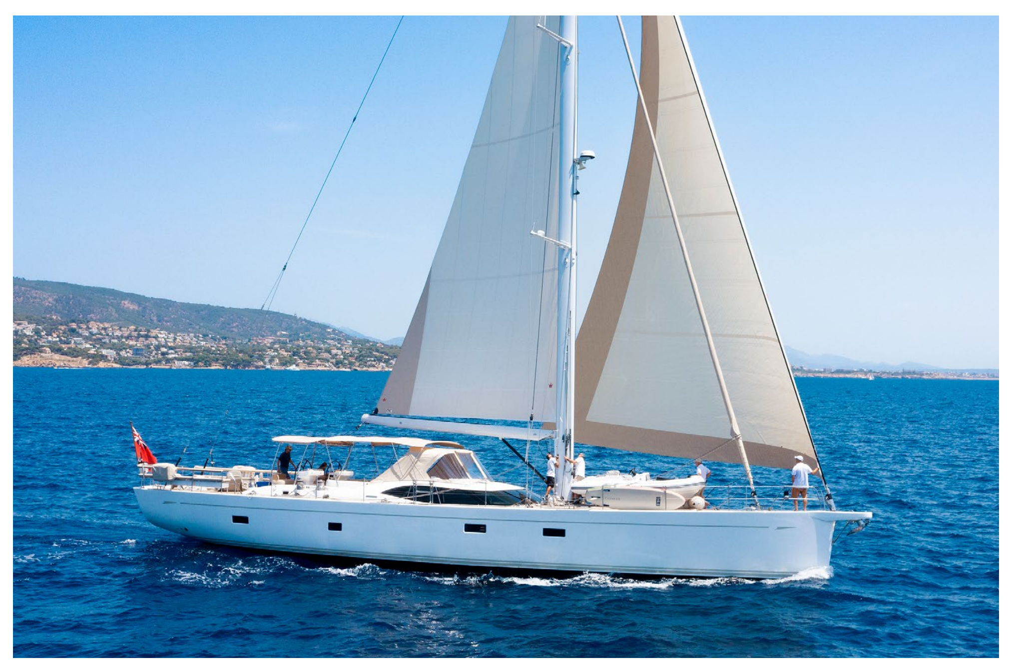
Oyster 825 CHAMPAGNE HIPPY