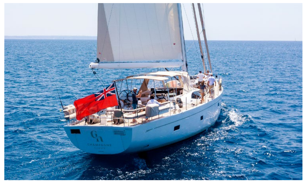
Oyster 825 CHAMPAGNE HIPPY