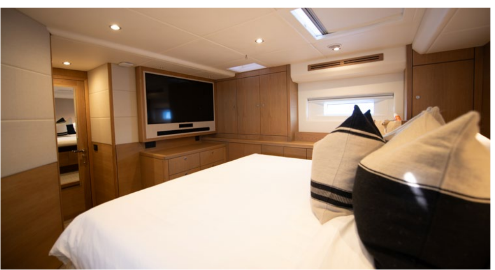
Oyster 825 CHAMPAGNE HIPPY