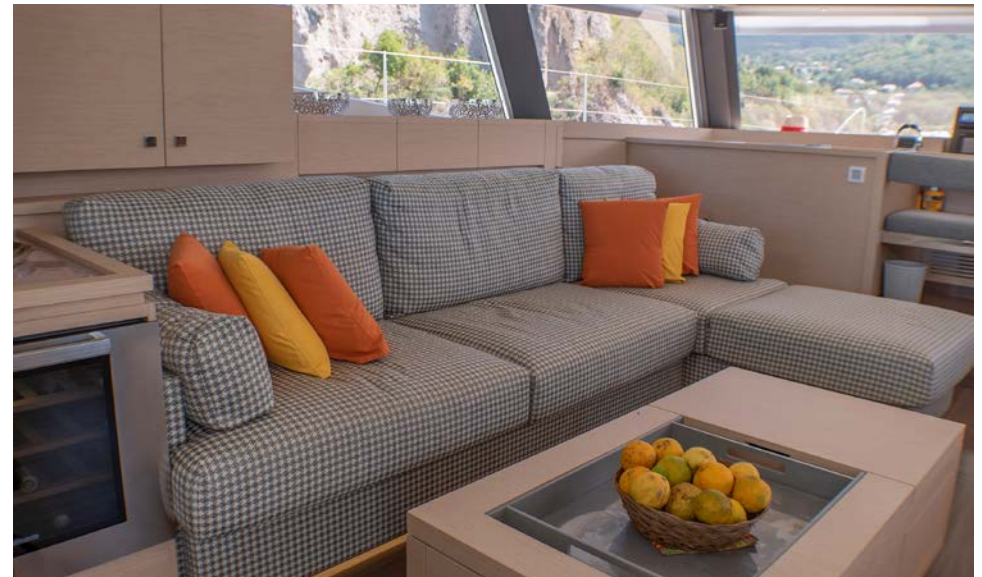
Ipanema 58 "Araok"