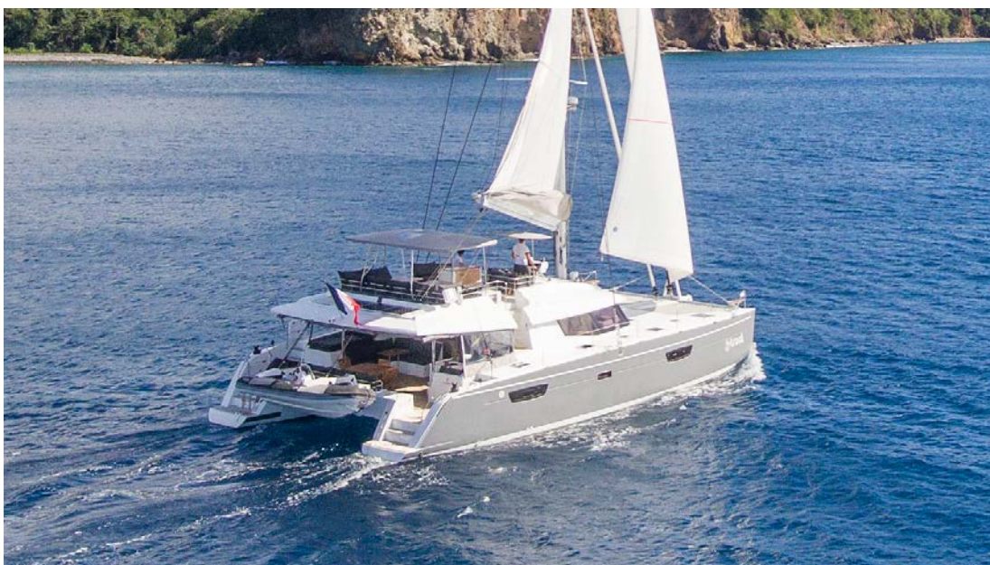
Ipanema 58 "Araok"