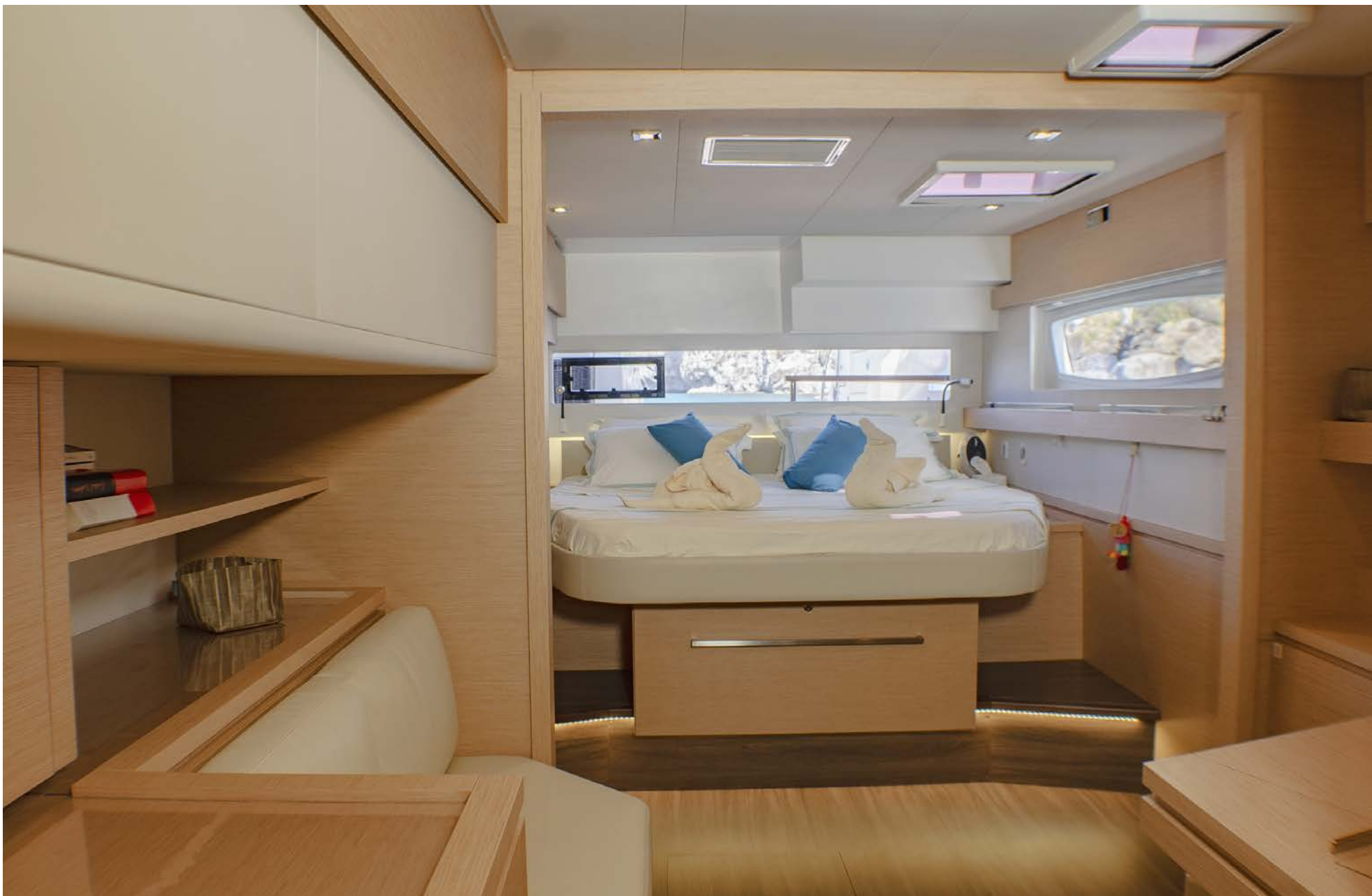
Ipanema 58 "Araok"