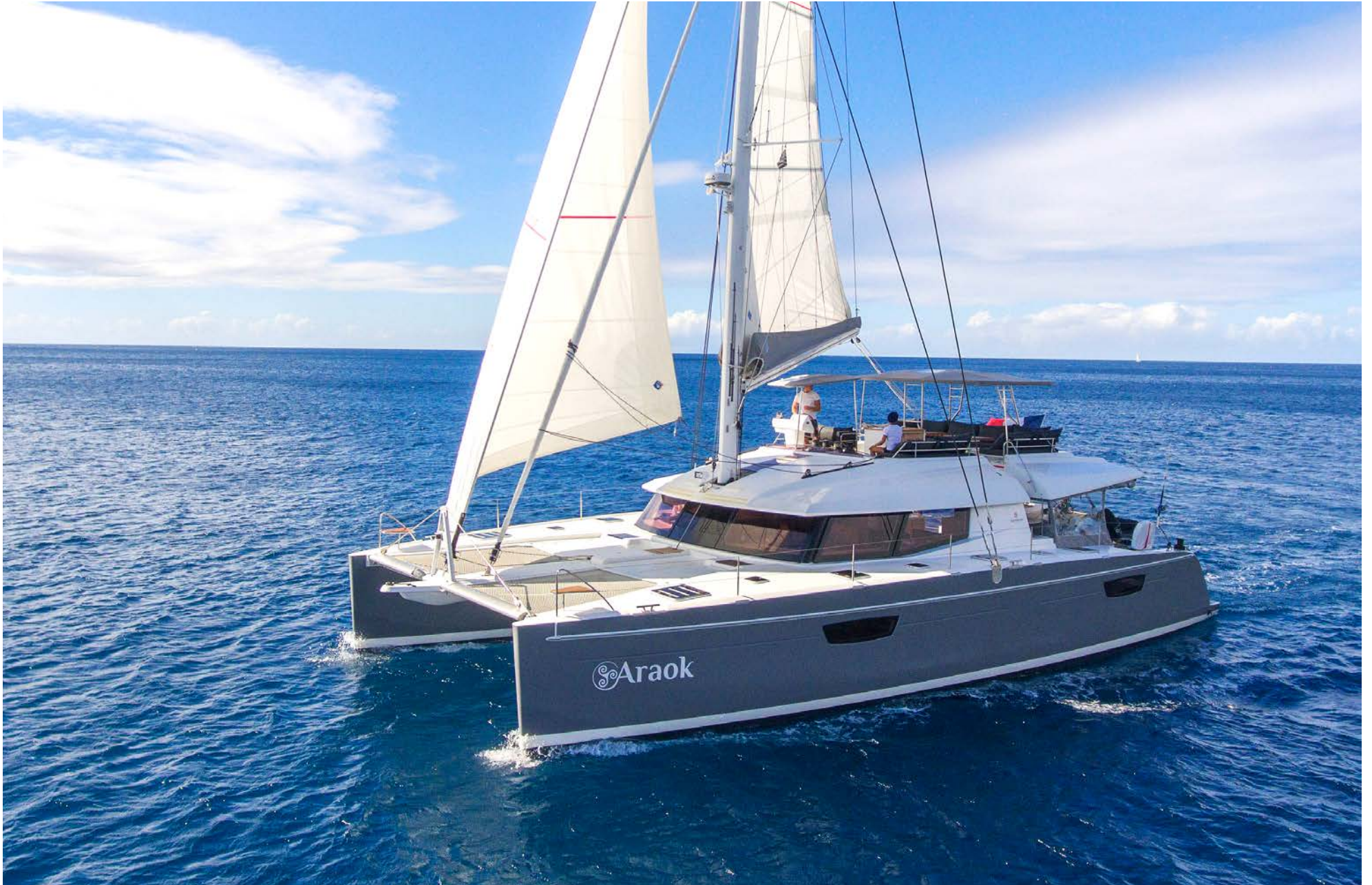
Ipanema 58 "Araok"