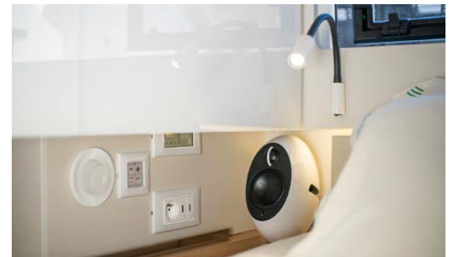
Ipanema 58 "Araok"