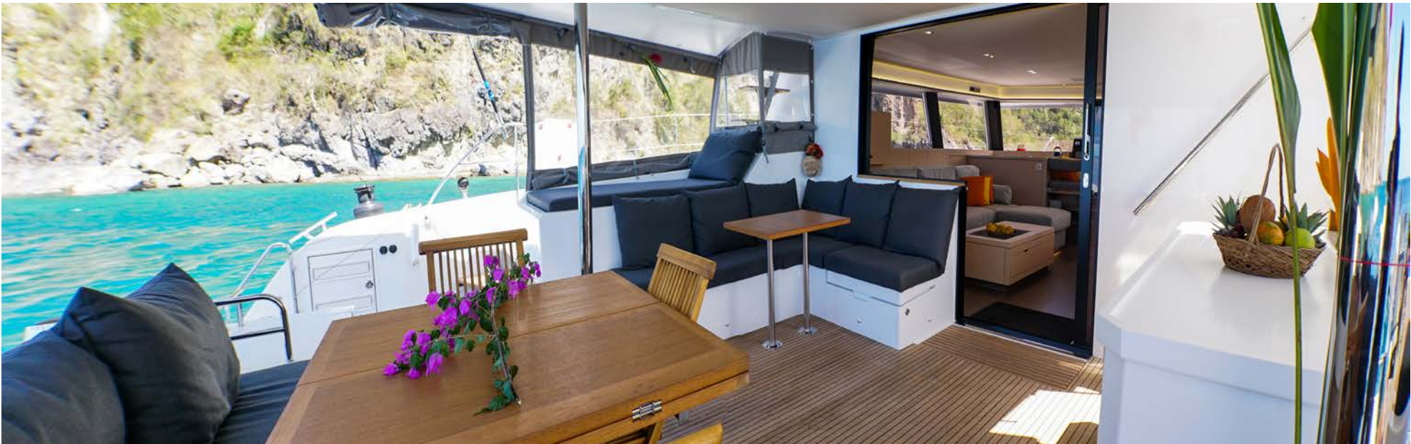
Ipanema 58 "Araok"