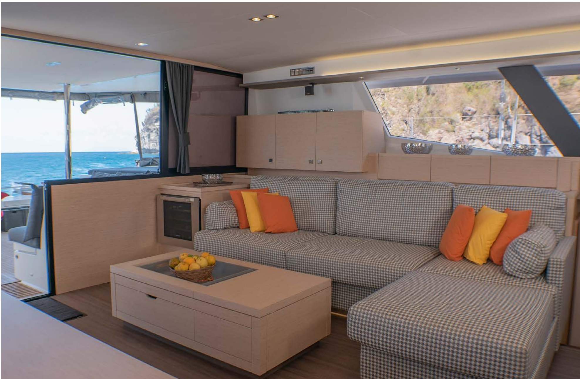
Ipanema 58 "Araok"