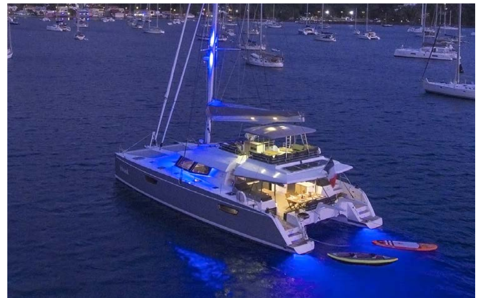
Ipanema 58 "Araok"