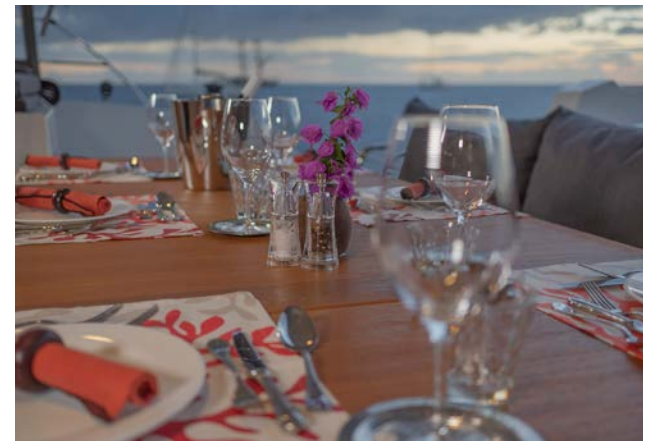
Ipanema 58 "Araok"