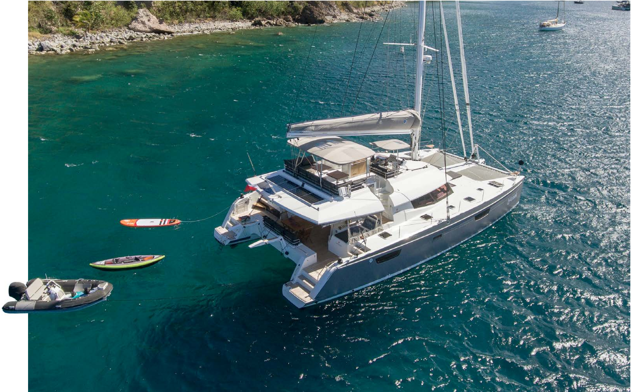
Ipanema 58 "Araok"