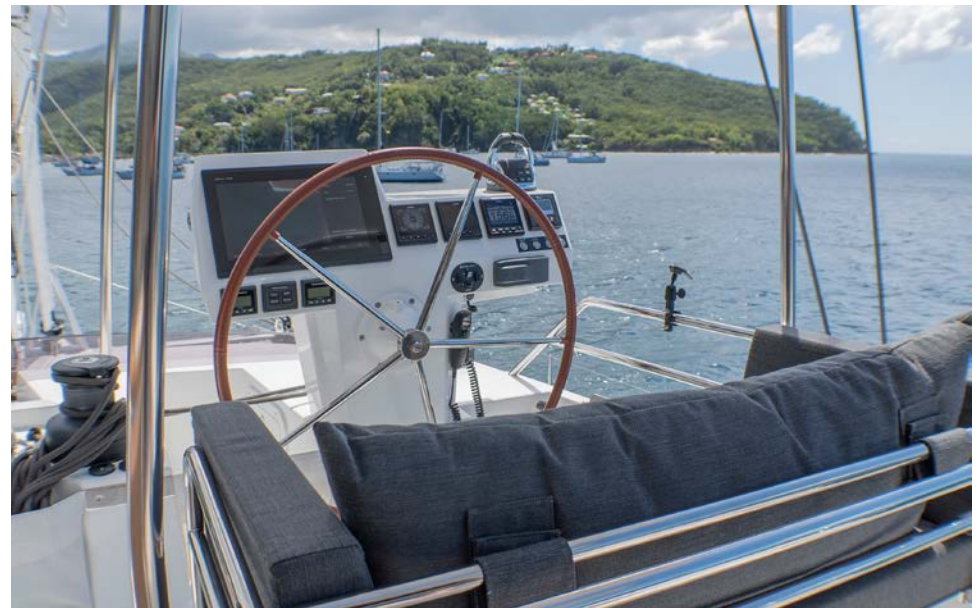
Ipanema 58 "Araok"