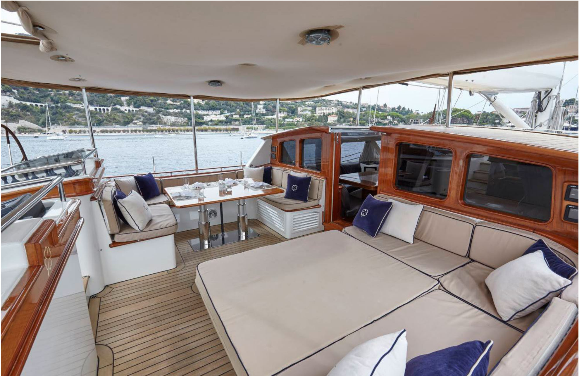
Alloy Yachts IRELANDA