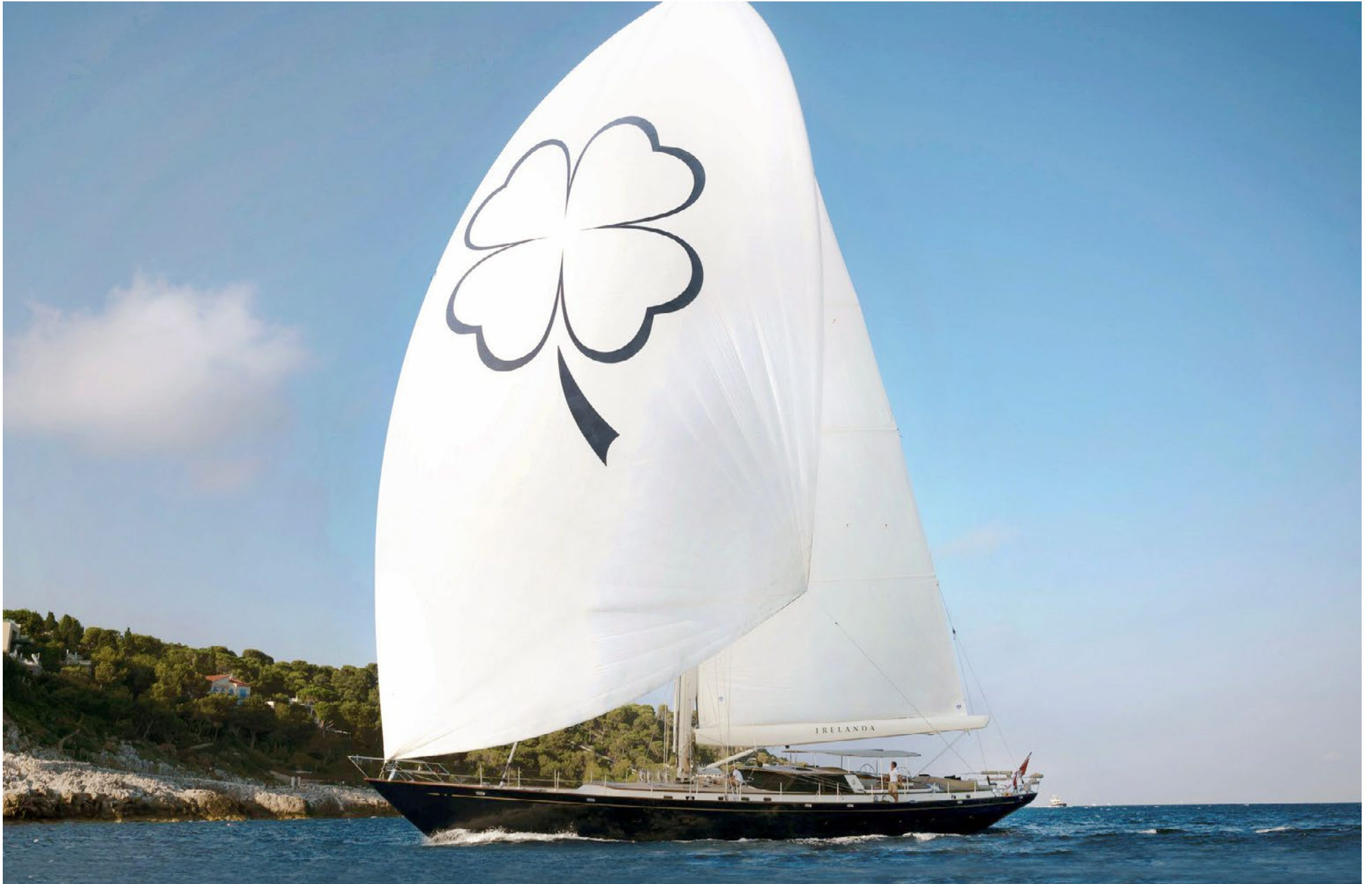
Alloy Yachts IRELANDA