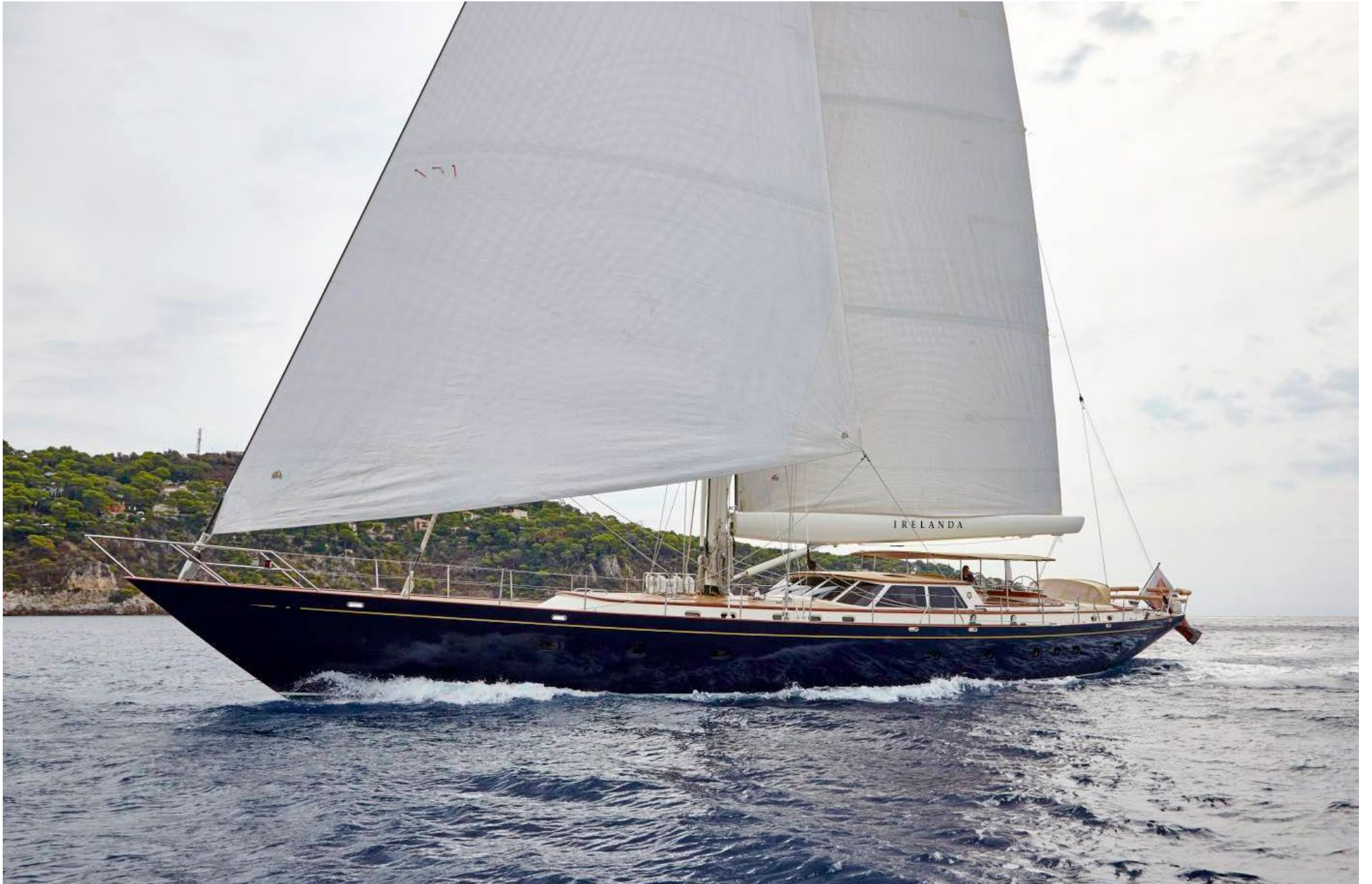
Alloy Yachts IRELANDA