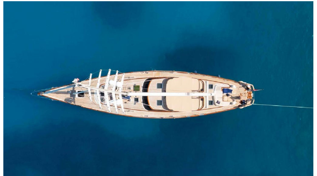
Alloy Yachts IRELANDA