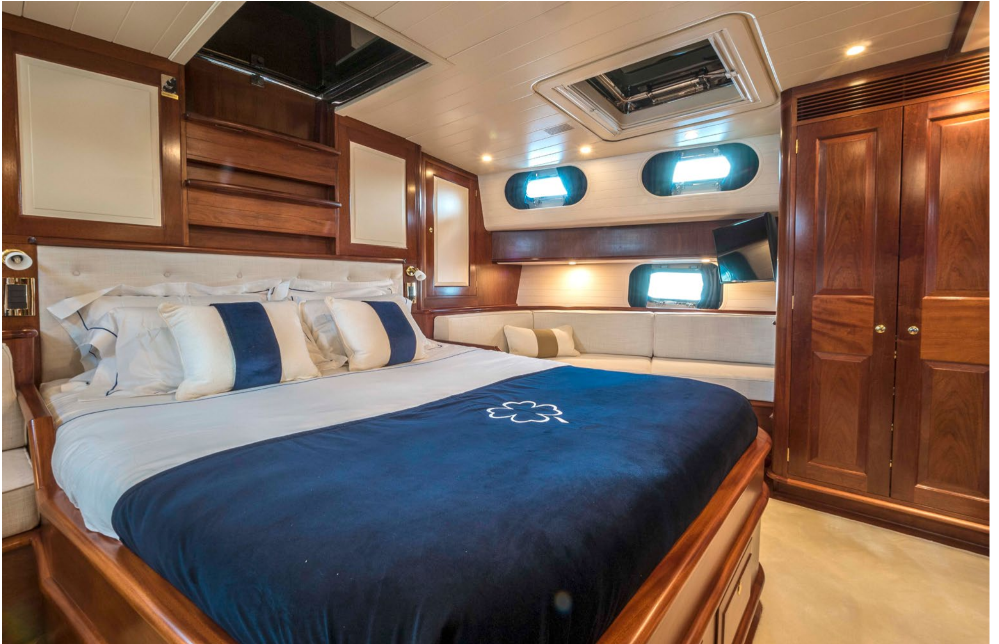
Alloy Yachts IRELANDA