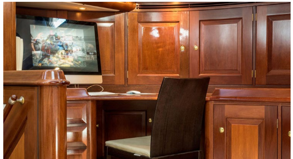
Alloy Yachts IRELAND A