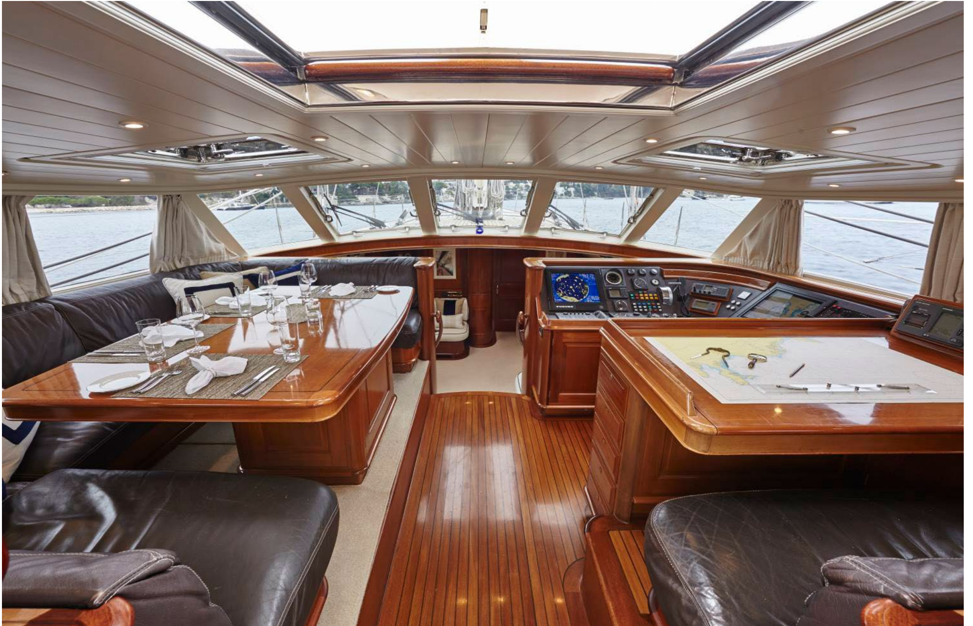
Alloy Yachts IRELANDA