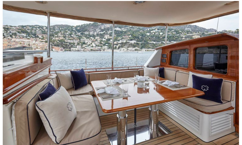
Alloy Yachts IRELANDA