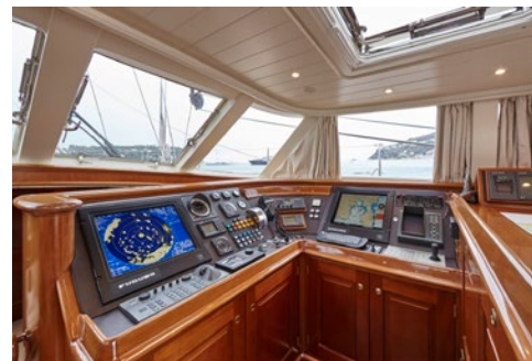
Alloy Yachts IRELANDA