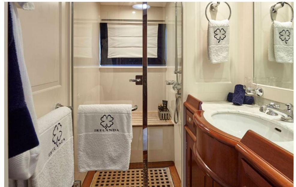
Alloy Yachts IRELANDA